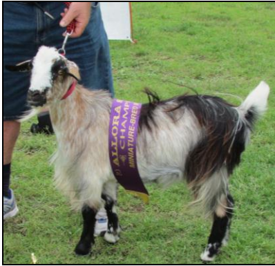
CHAMPION JUNIOR MINIATURE BRED WETHER Happy Herds Dakota (5+1=6pts)