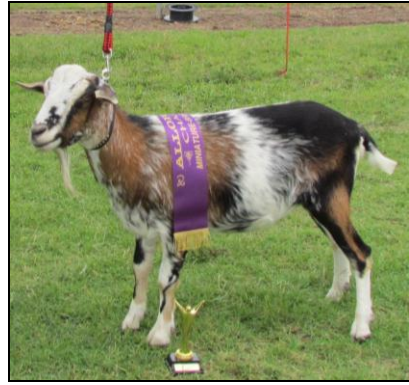
CHAMPION ADULT MINIATURE WETHER Happy Herds Braveheart (5+1=6pts)

20. Wether over 4 years (1) Happy Herds Braveheart, N & L Miller