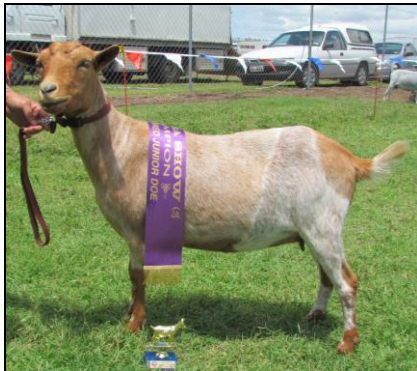
CHAMPION MINIATURE BRED JUNIOR DOE Minique Latte (5+13=18pts)