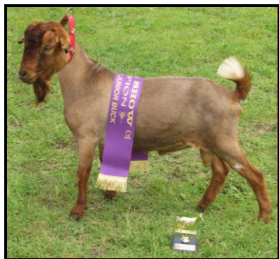
CHAMPION MINIATURE BRED JUNIOR BUCK Serendipity Valentine (5+3=8pts)