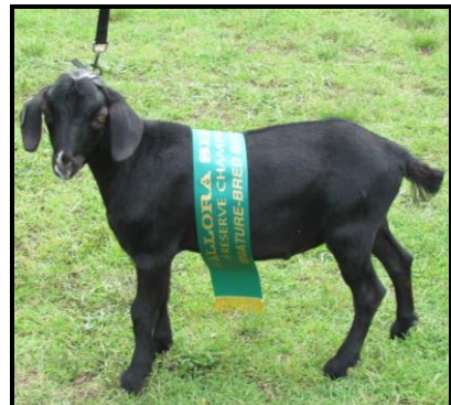
RESERVE CHAMPION MINIATURE BRED KID BUCK Craiglea Thunderstorm

23. Buck over 6 months & under 12 months (1) 1 st Minique Tuffy, C. Hale