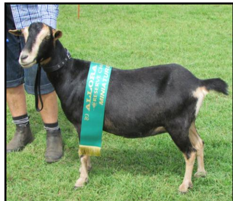
RESERVE CHAMPION ADULT MINIATURE DOE Just Kiddin Humdinger