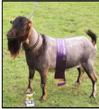
CHAMPION ADULT MINIATURE BUCK Serendipity Orlando (5+1=6pts)