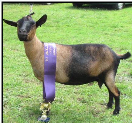
CHAMPION ADULT MINIATURE DOE Yattarna Tiffany (5+7=12pts)