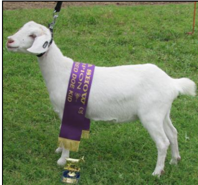
CHAMPION MINIATURE BRED KID DOE Minique Echointyme (5+14=19pts)