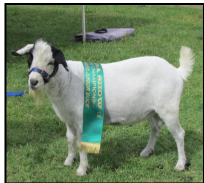
RESERVE CHAMPION MINIATURE BRED JUNIOR BUCK Minique Bee Bee King