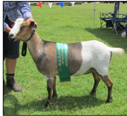
RESERVE CHAMPION MINIATURE BRED JUNIOR DOE Minique Venus