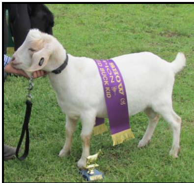
CHAMPION MINIATURE BRED KID BUCK Minique Tuffy (5+4=9pts)

22. Buck over 3 months & under 6 months (1) 1 st Craiglea Thunderstorm, R. Convery