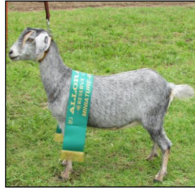
RESERVE CHAMPION MINIATURE BRED KID DOE Minique Mauve